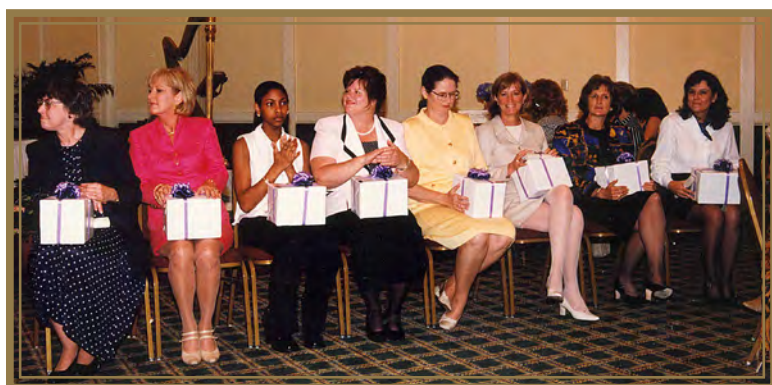
1999 Tribute Honorees

Crystal Anniversary tribute to women leaders