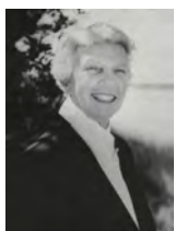
TERRY THOMAS FOUNDATION